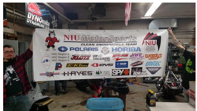
HWR Sponsors the NIU Clean Air Team

Exact details will be published in the next newsletter. 10 Rooms are being held at the Great Northern, 5 Rooms being held for the MN trip.