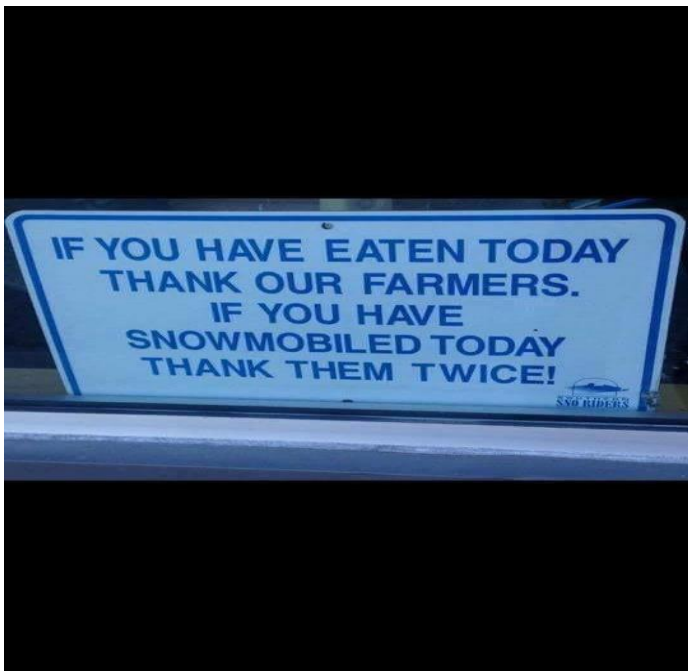
HWR Riding in Minnesota – Club Trip #2

Thank you to our farmers – without you there would be no trail system for our club to maintain