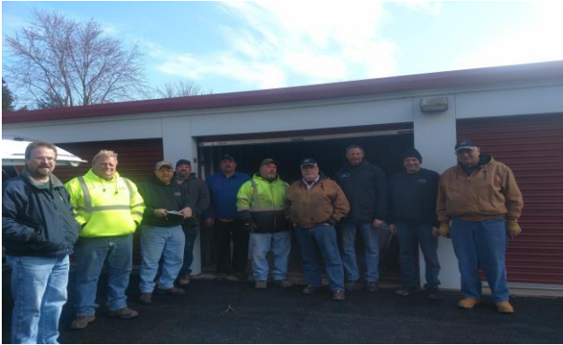
Photo from the 2018 crew

The Hampshire White Riders Snowmobile Club will finish the season with trail removal on Saturday April 6 th . Meet 9am at Hermann's Storage